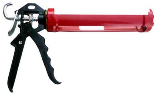
Manual extruder for LPS Sealant